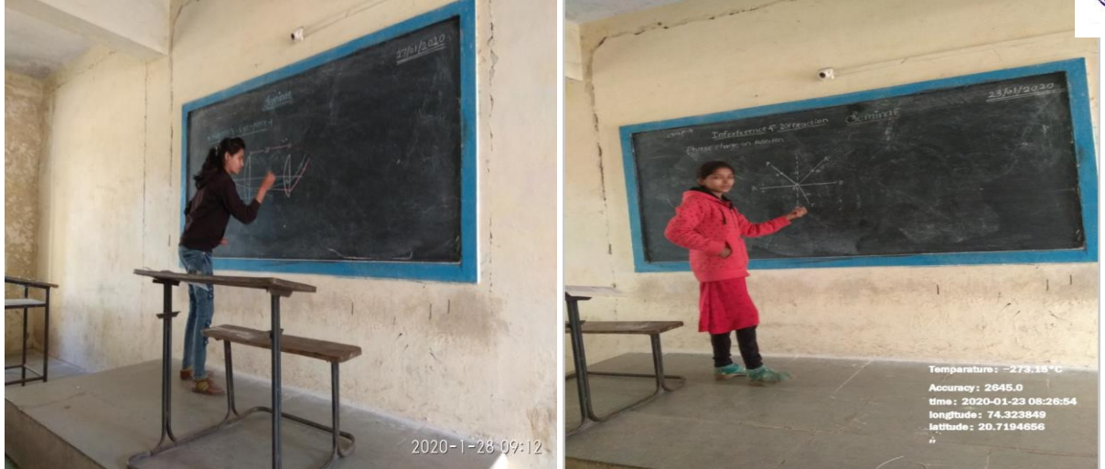
Student's participation in Seminar Competition on Optics