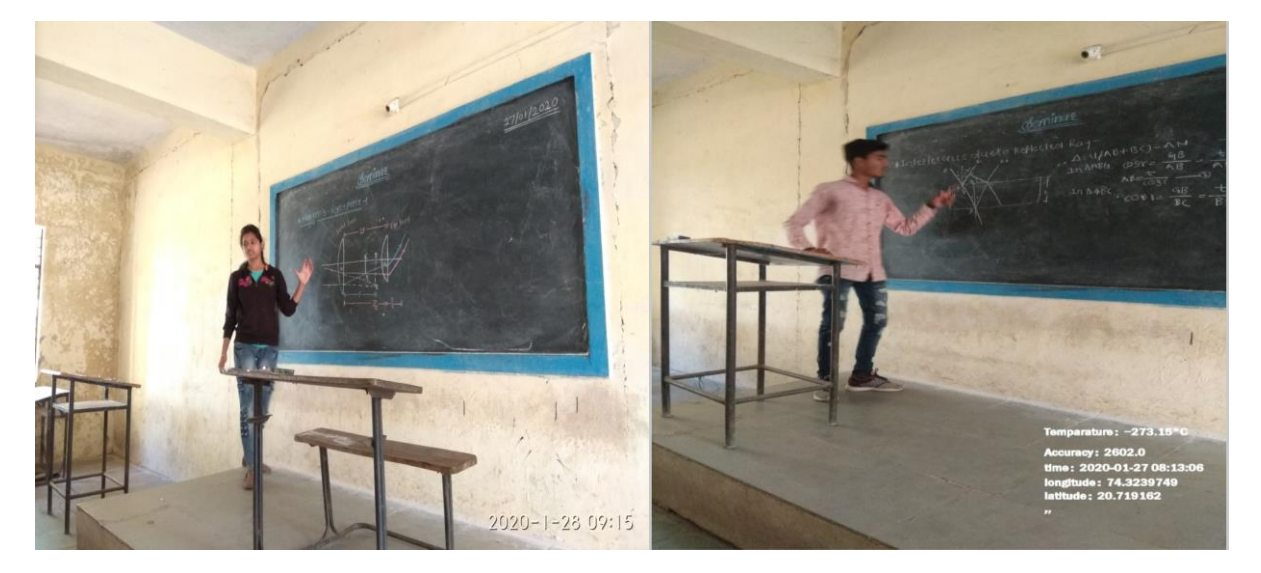
Student's participation in Seminar Competition on Optics